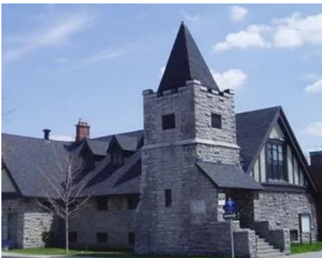
Église Unie St-Marc, Ottawa