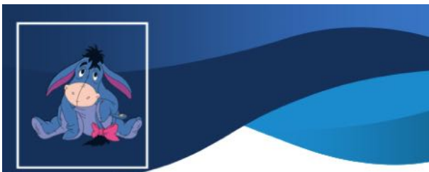
Fall 2019 – An invitation to all Ministry Personnel