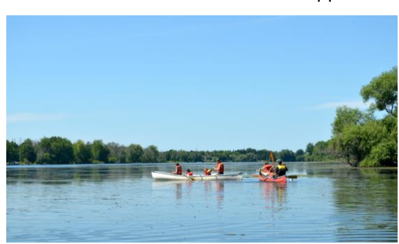
Rideau Hill Camp – Until next year!

The Camping Ministries of Camp Lau-Ren, Golden Lake Camp, Rideau Hill Camp and Camp Awesome have made the difficult decisions to cancel the 2020 Summer season. From this decision has come opportunities for these camps to embody a