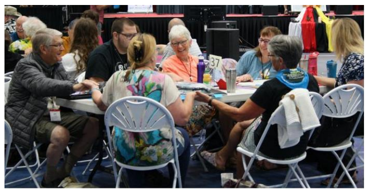
Participants at General Council 43 in Oshawa, ON, in July 2018.

GENERAL COUNCIL 44: POSTPONED UNTIL 2022 In light of concerns around COVID-19, the decision has been made to postpone General Council 44, previously slated for July 2021 in Calgary, AB, to 2022. Commissioners came to this decision at a special electronic meeting held on June 20, 2020; read the full news piece. Minutes from this meeting will be posted to the United Church Commons in the coming days, and updates related to this postponement will be posted to the General Council 43 website.