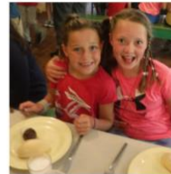
Everyone loves a bake sale!

What: Contribute the cost of making a bake sale item or what you would spend to buy baked goods.