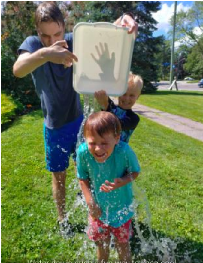
Water day is even a fun way to keep cool!

Your Super Awesome and Super Cool Coordinators