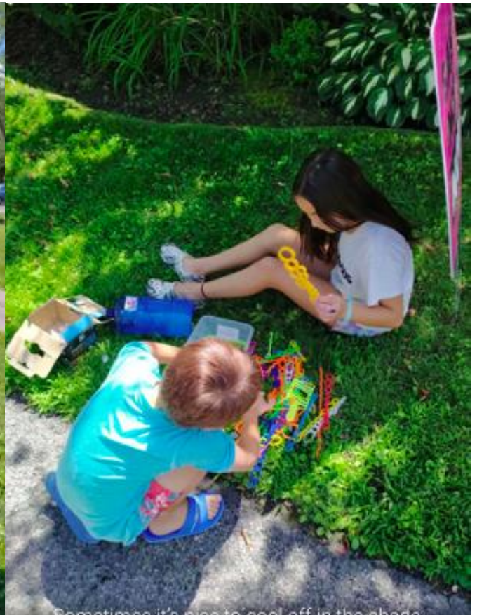
Sometimes it's nice to cool off in the shade!

EOORC News is a bi-weekly newsletter that provides information Communities of Faith of the EOORC, published every second Wednesday. If you want an item placed in the newsletter, please send it to nmatkovsky@united-church.ca by 12 noon on Tuesday the week of publication. If you do not wish to receive this weekly newsletter, please send me an email to the same address above.