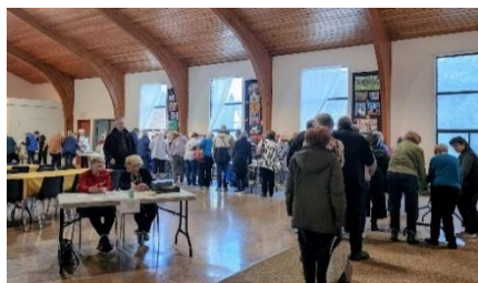
Bake sale crowd

Our UCW held their annual Fall Fair, Nov. 8 th , 2025. This is a fundraiser to support our outreach projects such as: Bissell, Operation Friendship, Jellinek, George Spady, Youth Empowerment & Support Services, WIN House, St. Albert Community Services, SAIF, Jessica Martel Foundation & St. Albert Seniors association. We began preparing early October to get the word out by Posters and a shout-out at church. Sign up sheets began to fill up and baking began. We got lots of support from our congregation. It was lots of work but also lots of fun. We usually have quite the run on sales from 1 – 2pm. Besides the baking, we sold pies prepared by UCW members and congregation, and served coffee, tea and juice. It was a time enjoyed by all. People often comment how early they must get there to get the goods. We made approximately. $3300, which certainly helps us with our budget for 2026. We also shared our day with our Outreach Committee for their Book sale, working together as a community and church.