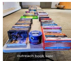
Outreach Book Sale